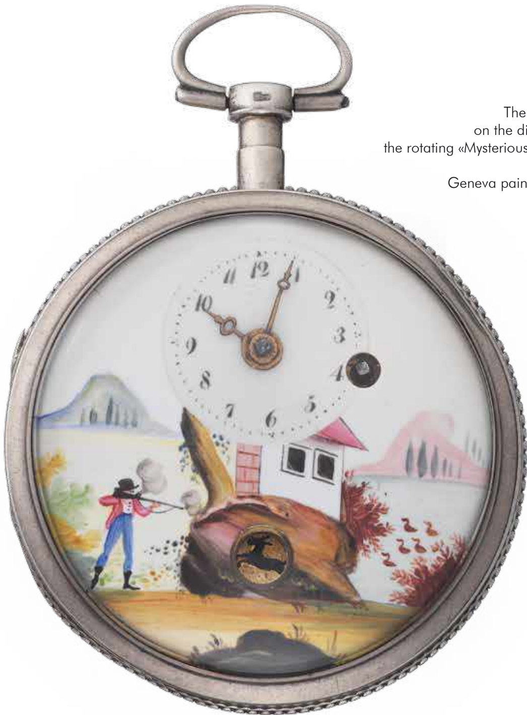
Girardier L'Ainé Pocket Watch, 1810