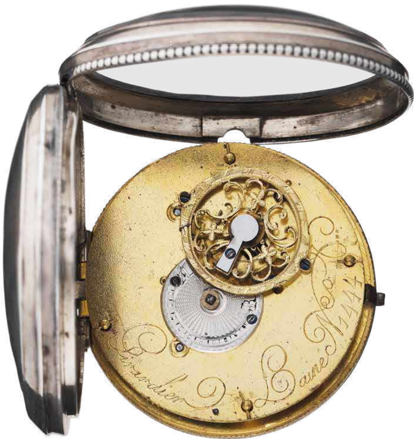
Girardier L'Ainé Pocket Watch, 1810