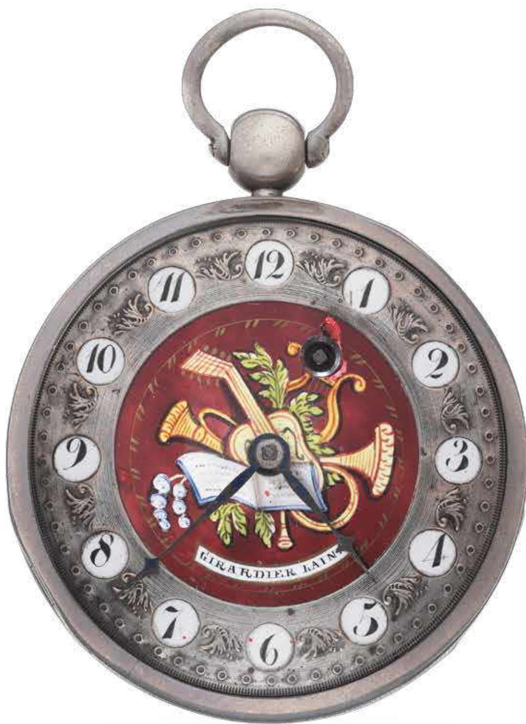
Girardier L'Ainé Pocket Watch