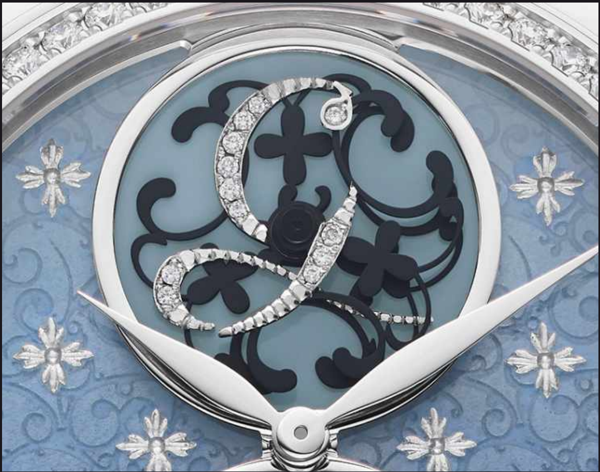
Mysterious Signature : patented