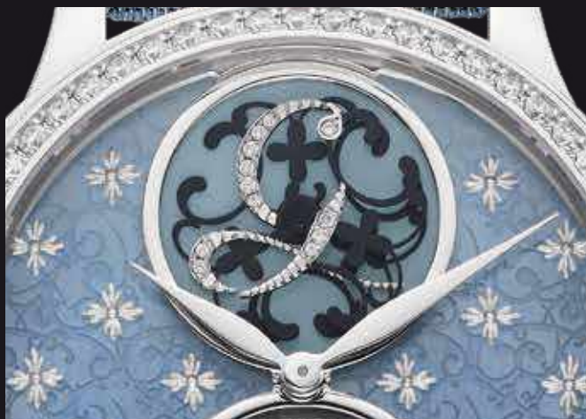
1809 Collection with modern animation «Mysterious Signature»