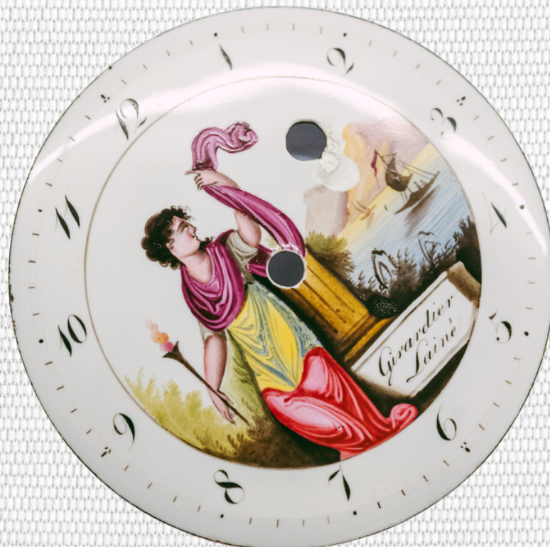
Girardier pocket watch dated 1800