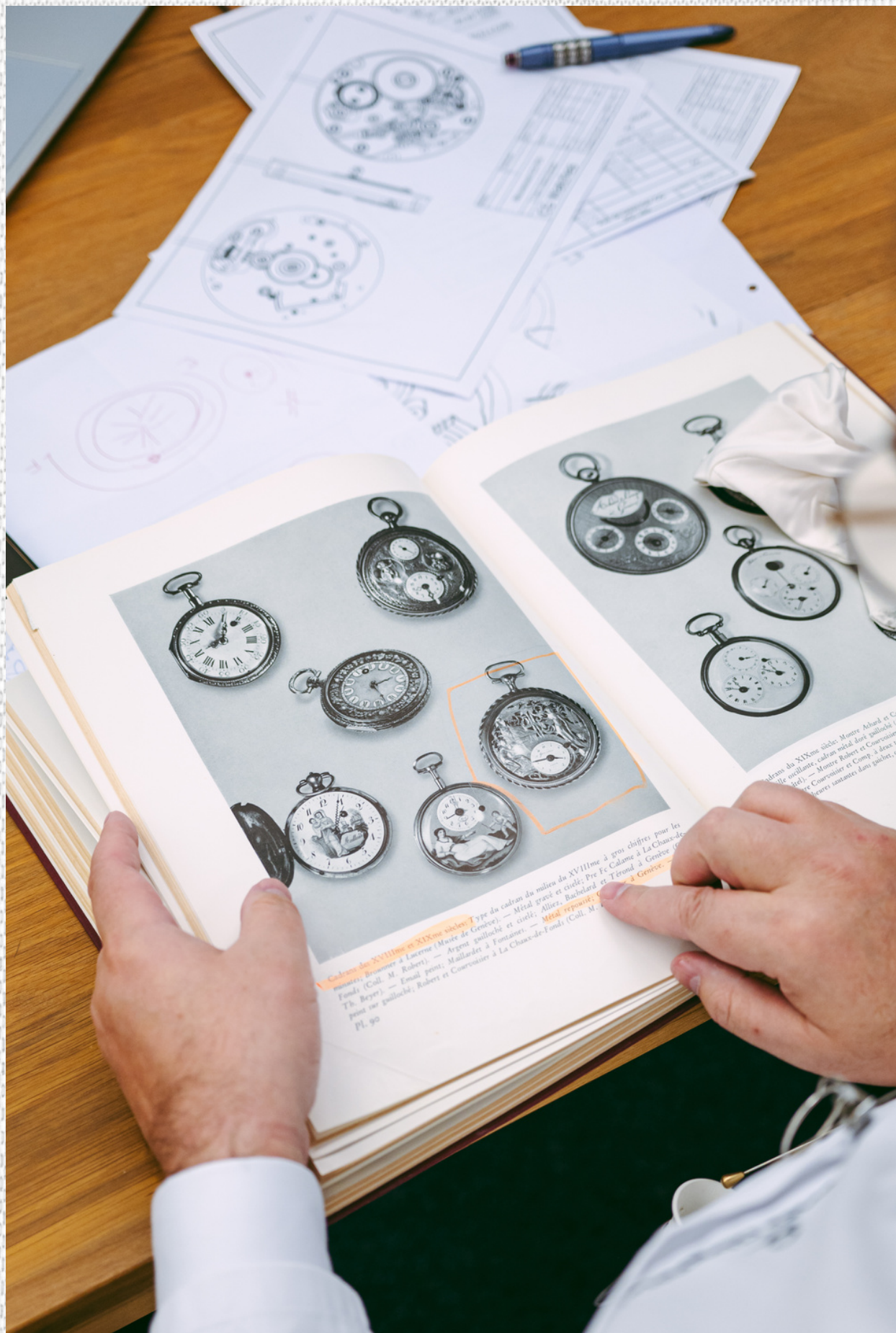
Girardier's pocket watch as a reference in a history book dated 1950 Histoire et technique de la Montre /Soc. suisse de chronométrie