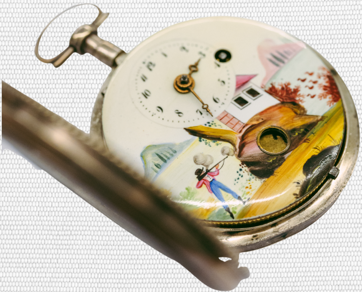
Girardier pocket watch dated 1800 Animated Hunting Scene