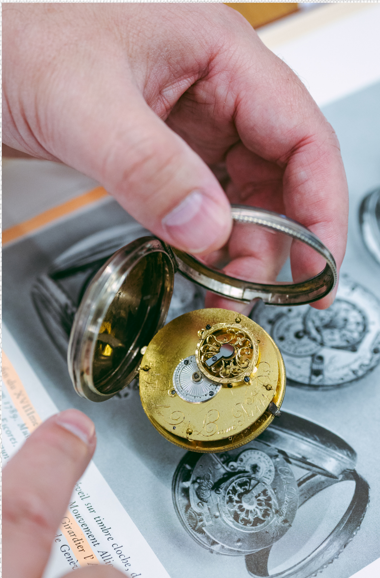
Girardier's pocket watch as a reference in a history book dated 1950 Histoire et Technique de la Montre / Soc. suisse de chronométrie