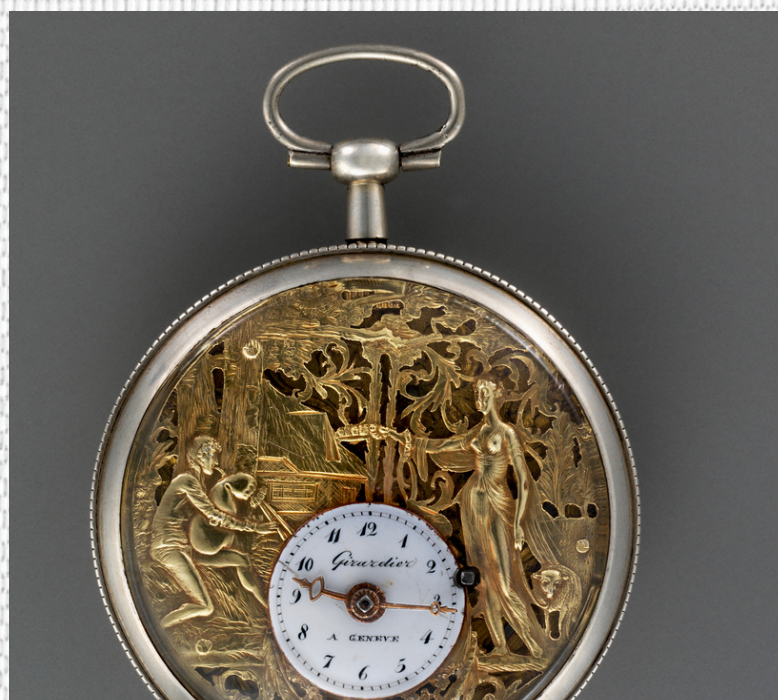
Museum of Geneva Inventory N.0075

The Charles Girardier House offers unique timepieces that embody sophistication, elegance, and innovation while leading the industry of contemporary watchmaking artwork. For those who appreciate the art of watchmaking, a Charles Girardier timepiece is not just an accessory, but a masterpiece.