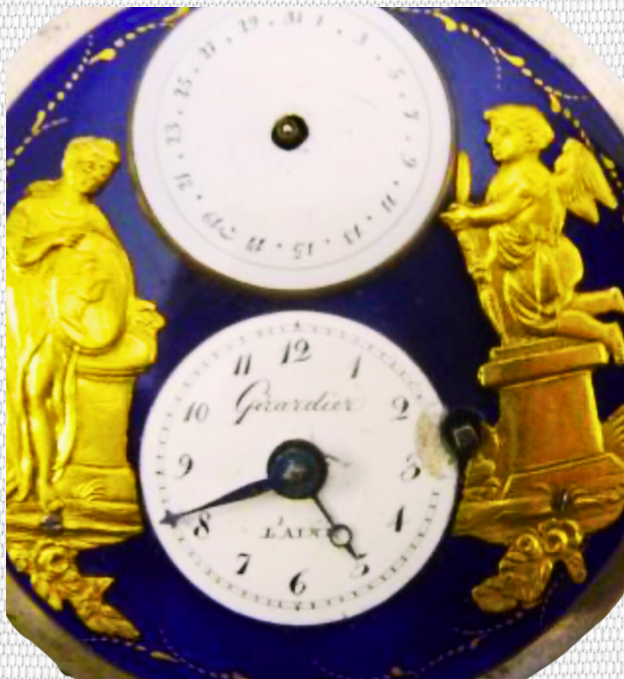
Museum of Fine Arts of the City of Paris, Inventory PP03299

The fourth collection named Plenitude will feature an in-house caliber with a power reserve display including a cone used in pocket watches and is set to be released in Spring 2024.