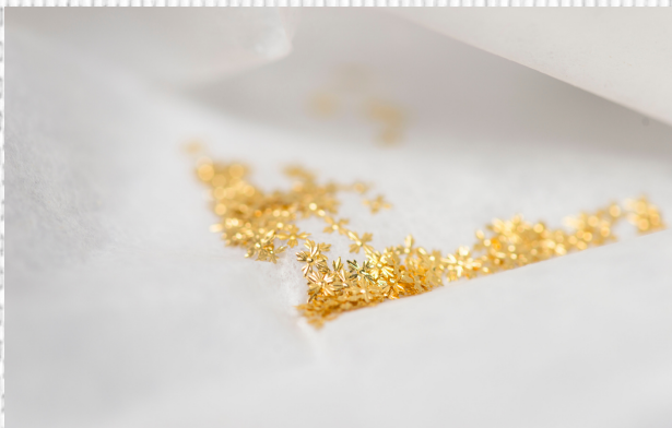
Paillons (Salt Flowers)