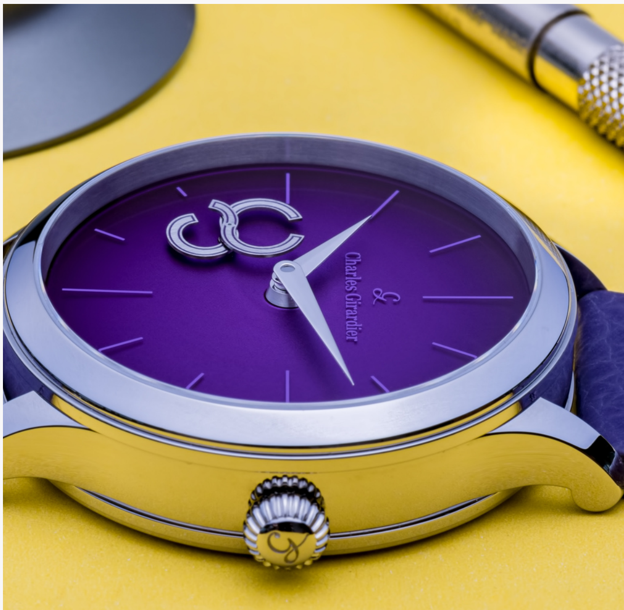
Magic 8 CG.TI5.01.P01 - Majestic Purple