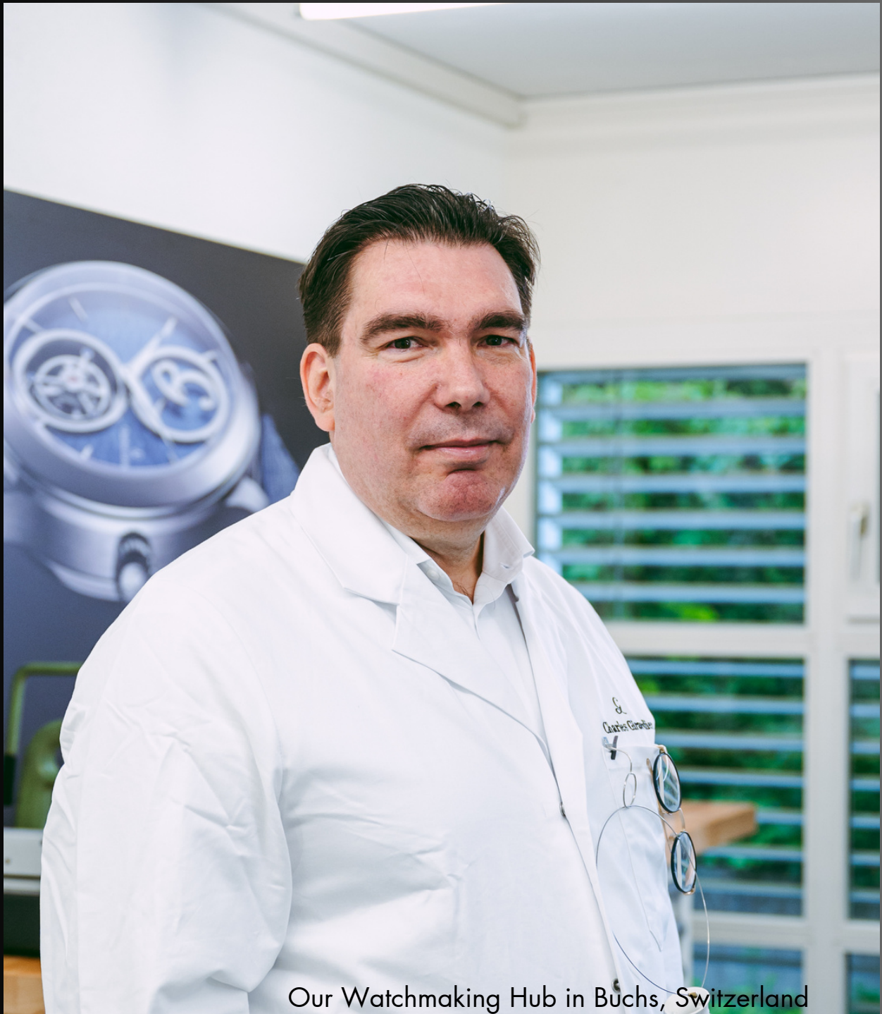
Our Watchmaking Hub in Buchs, Switzerland