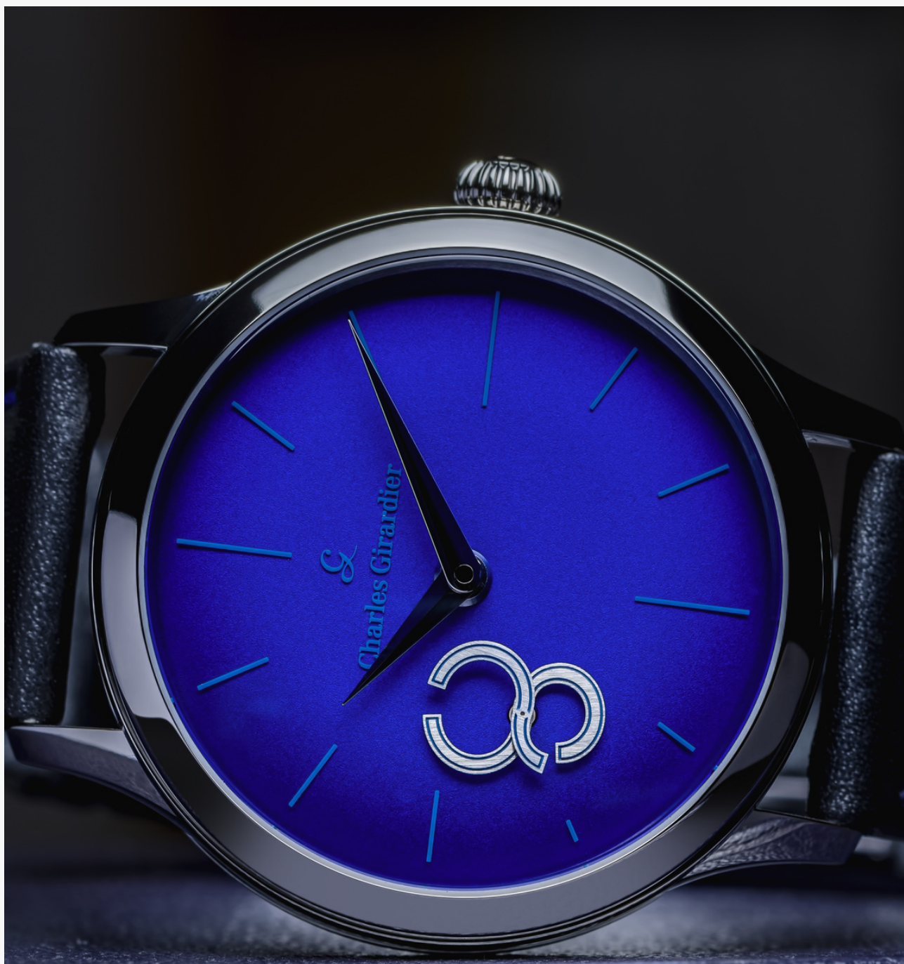
Magic 8 CG.TI5.01.B01 - Cobalt Blue