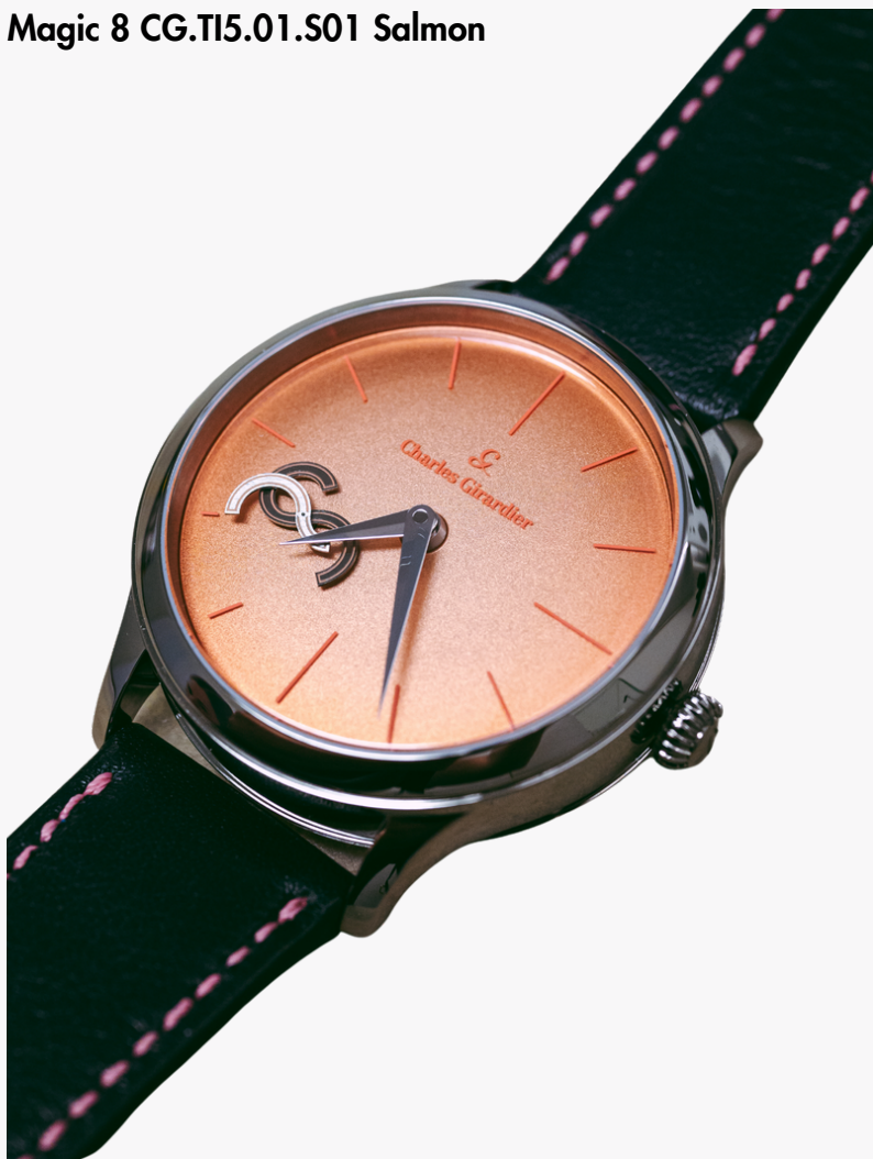
Magic 8 CG.TI5.01.S01 Salmon