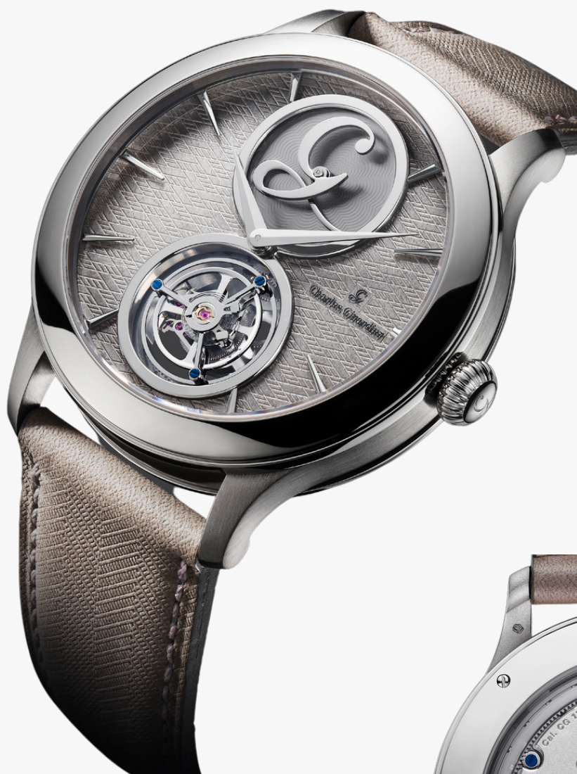
Mysterious Signature CG.OG1.01.G01 Chromium Grey