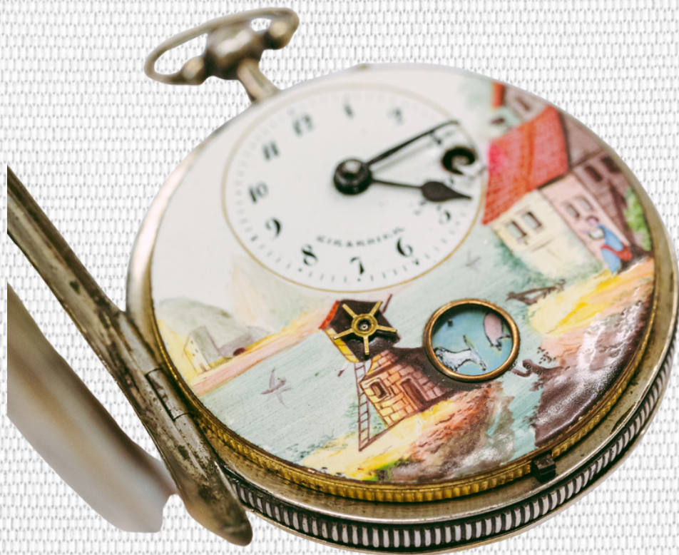
Girardier pocket watch dated 1800 Animated farming Scene